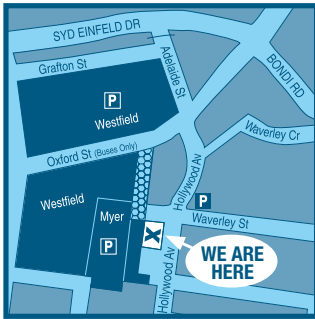
Bondi Junction 3 Waverley St ~ Enter from Hollywood Ave