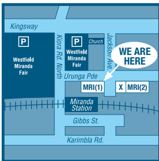
Miranda MRI & Nuclear Medicine 38-40 Urunga Pde