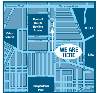
Camperdown (Brain & Mind Research Inst.) Ground Floor, 94 Mallett Street