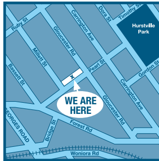
Hurstville Private Hospital Specialist Medical Clinic, Lvl 1, 2 Pearl Street