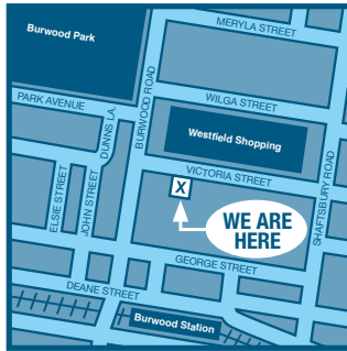
Burwood 36-38 Victoria St East