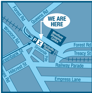
Hurstville Central Shopping Centre 225H Forest Rd (Carpark Lvl above Station)