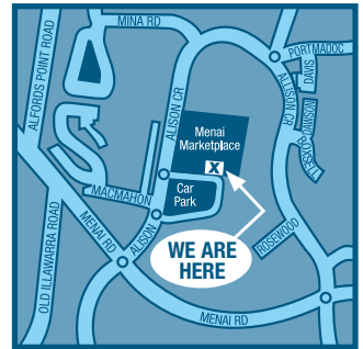
Menai Lvl 1, Menai Market Place, Allison Cres