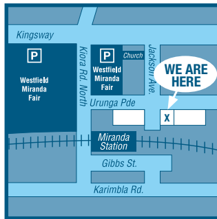
Miranda 32-36 Urunga Pde